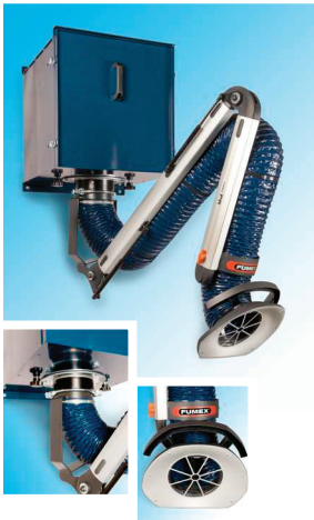
VF 2000 / VF 3000